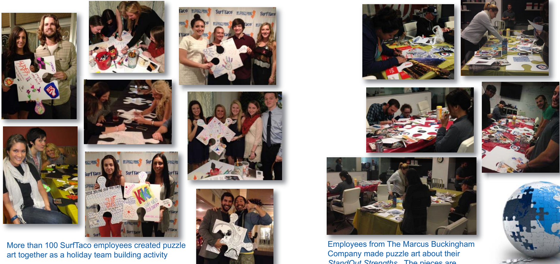
More than 100 SurfTaco employees created puzzle art together as a holiday team building activity

Corporate Team Building Workshops. It fits most every group and the analogies and metaphors that can be made between the Puzzle Project, employees, work and life are endless.