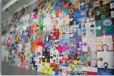
Art Connect New York Soho, NYC

Arts Groups are a very natural fit with the Puzzle Project. Fine arts organizations are always looking for fun collaborative project and tend to completely embrace and really run with this project.