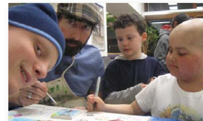
The Valerie Oncology Center