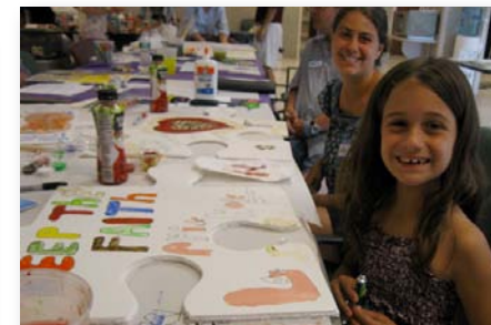
MC&OC Brain Tumor Support Group