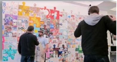
inRivers Art Space Greenpoint, Brooklyn NYC