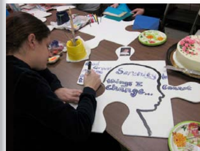
JSAS (methadone treatment facility)