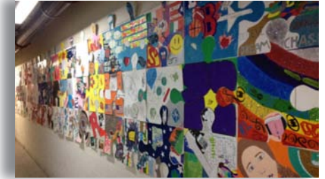
Monroe Center for the Arts Hoboken, NJ