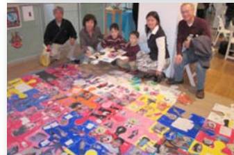
The Queens Museum of Art Queens, NYC