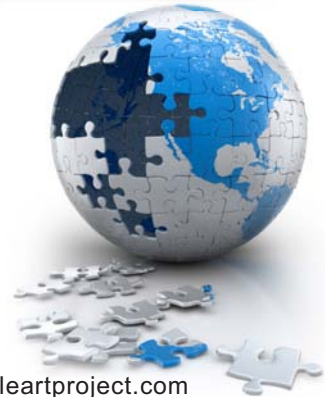
Employees from The Marcus Buckingham Company made puzzle art about their StandOut Strengths . The pieces are exhibited at their office on Wilshire Blvd in Beverly Hills, CA