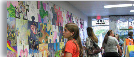
Fine Arts Blount Merrville, TN