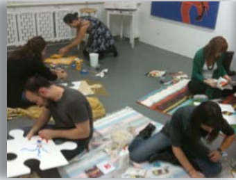
Reaves Gallery Chelsea, NYC